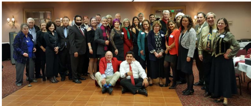
Thanks to all for celebrating the holiday with Enrolled Agents!